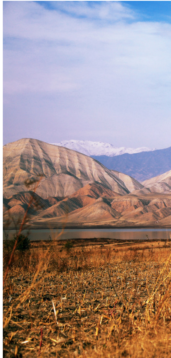
Fig. 3 Kyrgyzstan, in the vicinity of the city of Osh

From the security angle, the work on the exchange, training and cooperation projects already being implemented in cooperation with the USA within the framework of the "Partnership for Peace" programme should be further intensified. This can enable the states of Central Asia to be offered an attractive alternative to the international security organisations dominated by Russia and China. The aim should also be to establish conflict regulation mechanisms in the respective armed forces so as to reduce the probability of interstate, domestic and ethnic conflicts. In addition, the cooperation in the fight against transnational terrorism as well as in drug, arms and human trafficking should be intensified. The result could be that confidence-building measures lead to spill-over effects in other areas of politics. 🏡