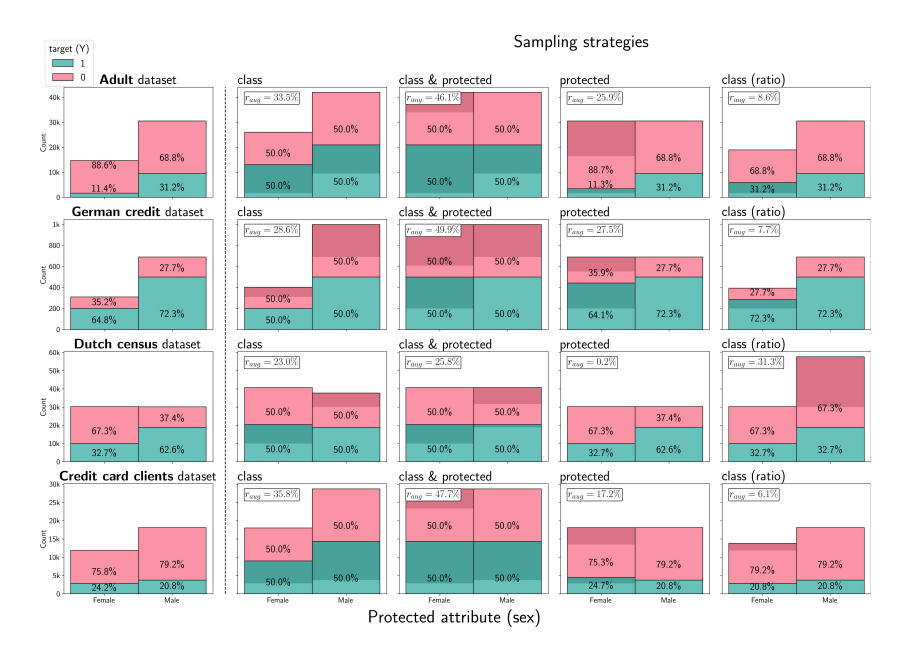
Fig. 1. Distributions of class and group imbalance for each real dataset (first column) along with final augmented dataset for each sampling strategy.

both class and group parity. We define each sampling strategy in detail hereafter and provide a visual representation of the final distributions of the augmented data for each sampling strategy on all datasets in Figure 1.